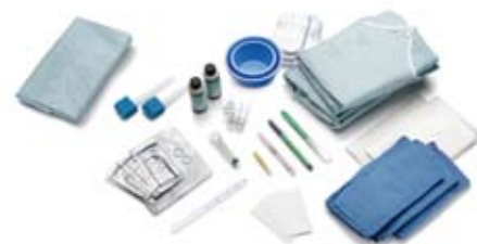
ClosureRFS procedure pack also available