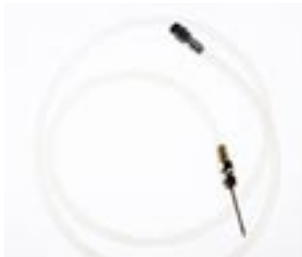
Hose with needle