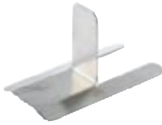
Wedge stainless steel